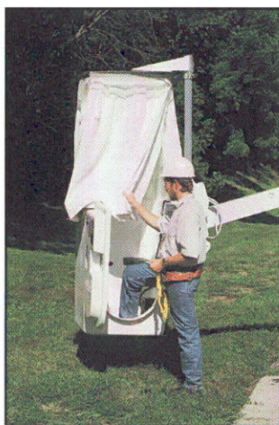
End-Mounted Splicer Platform