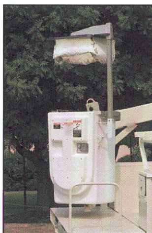
Side-Mounted Splicer Platform